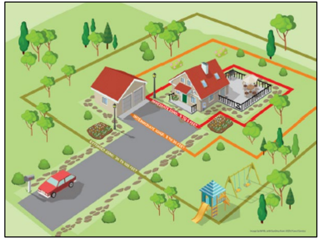
Home Ignition Zones (HIZs)

Homes that are impacted by wildfire is most often the result of exposure to embers. Practicing home hardening principles will increase the chances that a home will withstand the wind-blown embers from an advancing wildfire.