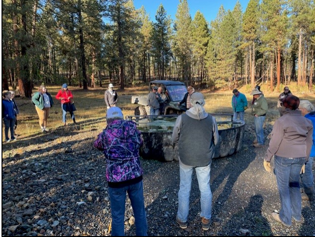
Discussing Water Development Projects