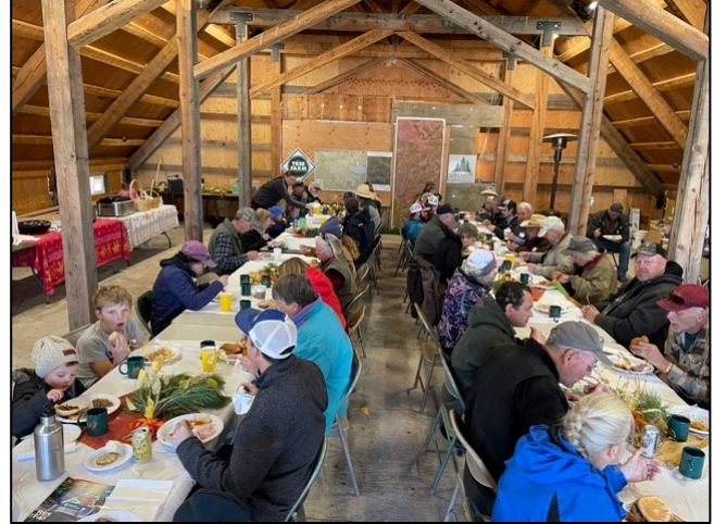
Enjoying a Great BBQ lunch